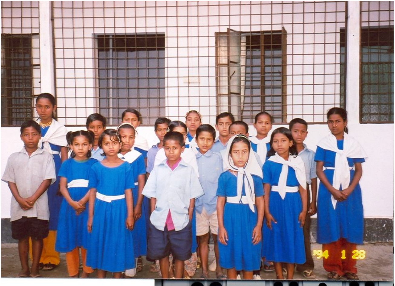
Picture of primary school students get backup education support from SOHAY

As SOHAY use family approach to bring change in the society, the other target group of SOHAY are slums children. SOHAY assisted slum children in their education. It assists them to take admission at Government Primary School assisted them to complete their daily homework. In year 2005 SOHAY provided back up support to 60 children under backup support to pre-primary education programme and 25 children under primary education programme. As mentioned under pre-primary backup education support programme SOHAY supports 60 children this year. SOHAY provided basic education to them which they are supposed to get from family members. This is very important for them to get admission at Government school at class one.