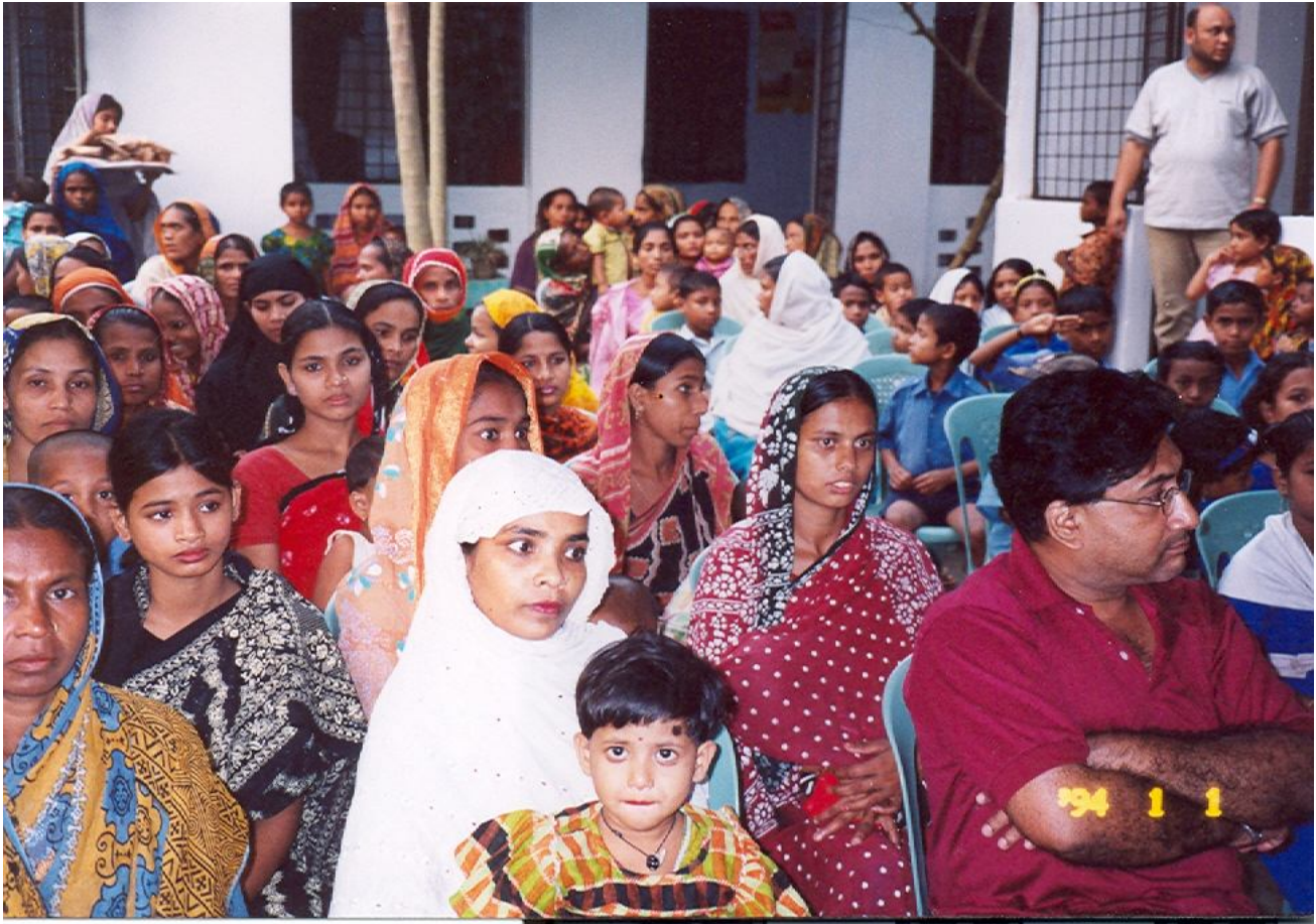
Audience of REFLECT programme inauguration meeting